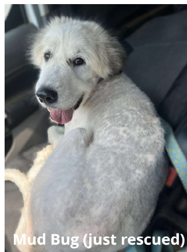
Mud Bug (just rescued)

And as if that weren't enough, the news got even harder to hear. His left knee—though not as urgent—had a kneecap that slipped in and out of place. Both that knee and his injured hip were already developing arthritis. He had been living with pain for far too long.