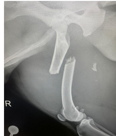
Buddy's leg, pre-surgery