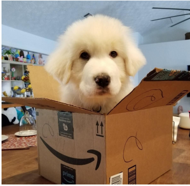
Whistler the Puppy

CLICK HERE TO DONATE TO OUR THANKSGIVING MATCH CAMPAIGN