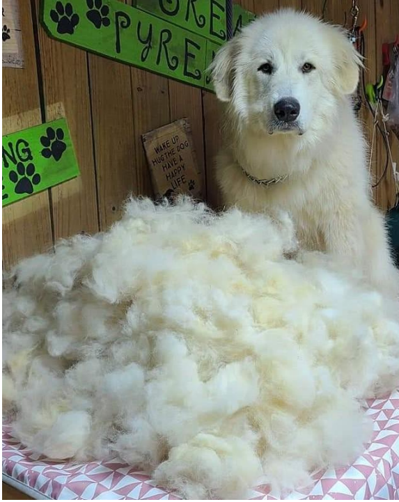
Sue after her grooming