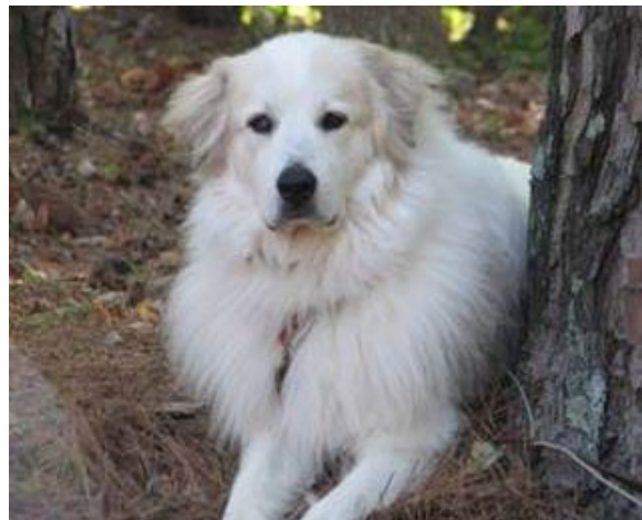
Korine after some TLC