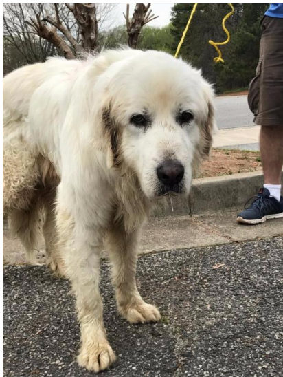
Pence when he first came in