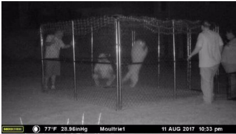
Milton being captured

and gentle giant and is now ready for adoption.