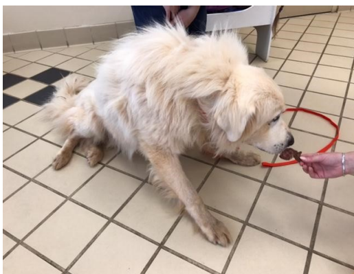
Rendy at Intake